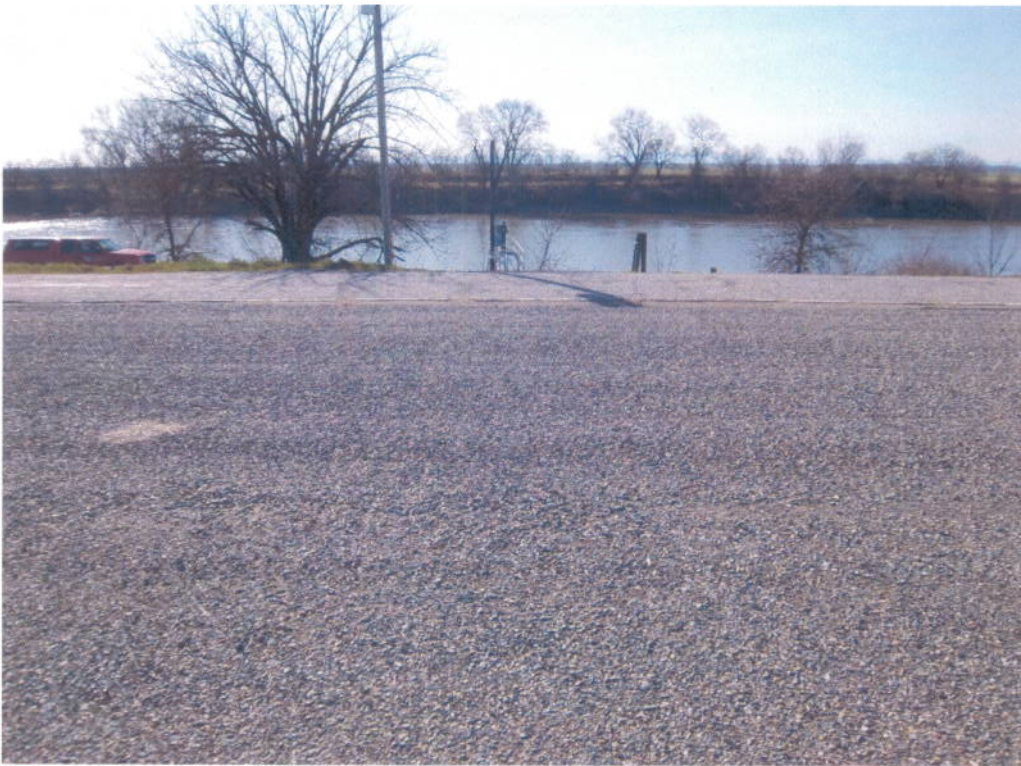
Photograph 2: Looking west at the Lauppe North River Pump from top of adjacent levee.