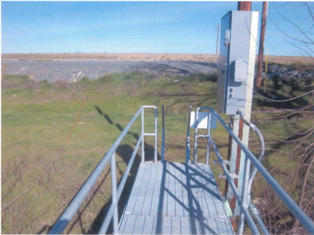
Photograph 1: Looking east toward Garden Highway and levee from Lauppe North River Pump (River Mile 77.7).