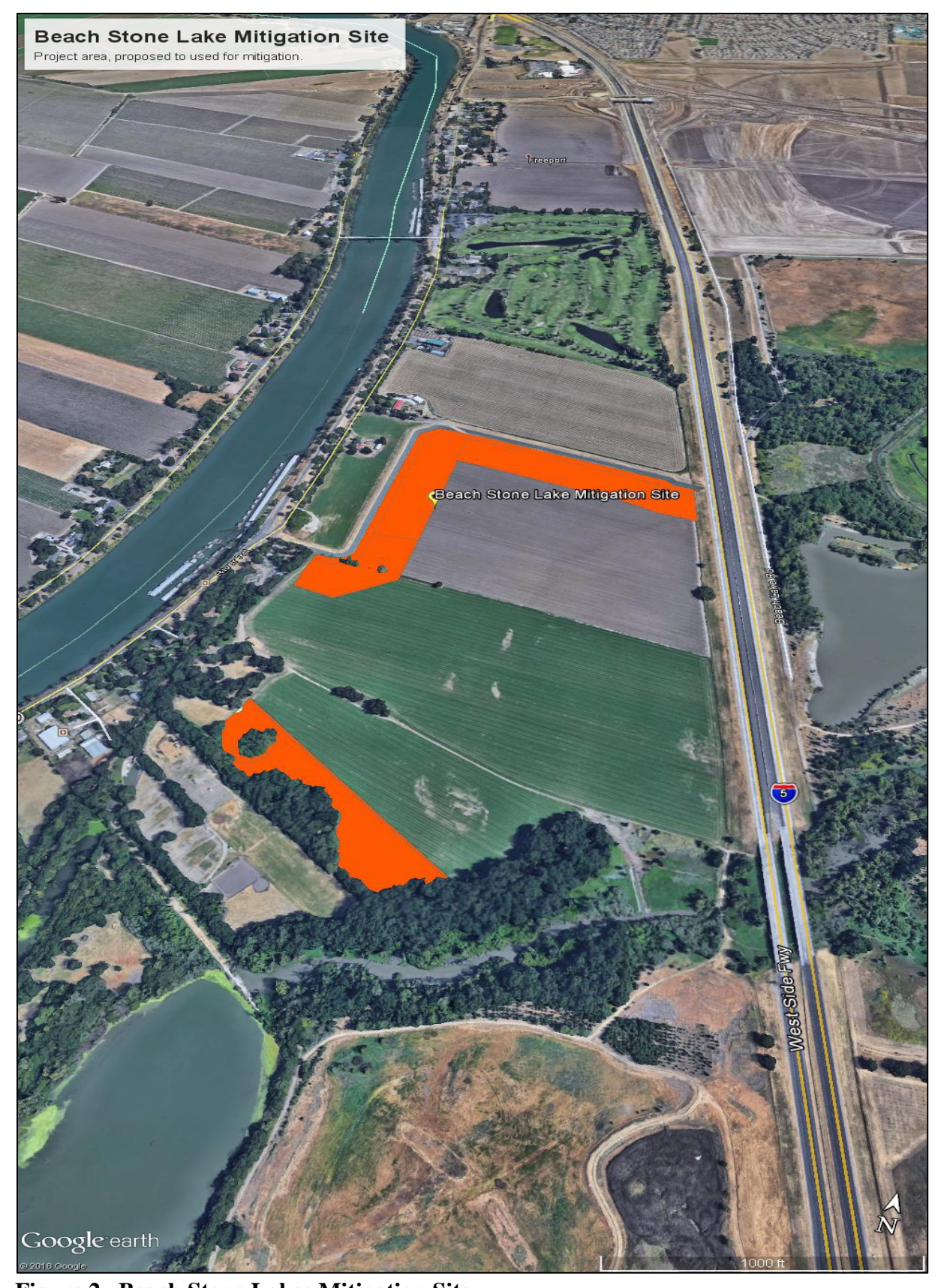
Figure 2. Beach Stone Lakes Mitigation Site