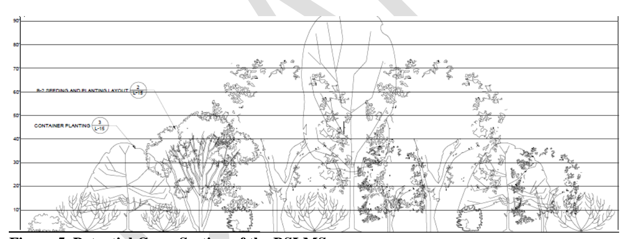
Figure 5. Potential Cross Section of the BSLMS.

When finished, the BSLMS is expected to create an estimated 24.2 acres of riparian habitat. At a 2:1 mitigation ratio, this 24 acres of new riparian habitat would mitigate for up to 12 acres of riparian habitat that may be removed from the Sacramento River levees during construction of the ARCF 2016 Project. The new riparian habitat would be self-sustaining, with mature trees that offer perching, foraging, and nesting habitat for birds of prey, and shelter opportunities to prey species. The majority of the site is currently bare dirt or in seasonal crops. The long-term benefits of the new 24 acres of riparian habitat would substantially exceed any direct or indirect short term adverse impacts to vegetation and wildlife caused by construction of the BSLMS.