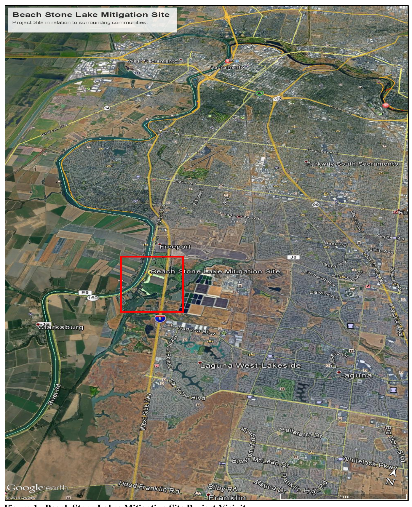
Figure 1. Beach Stone Lakes Mitigation Site Project Vicinity.