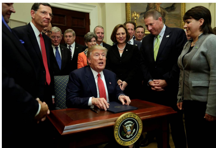
Photo: U.S. President Donald Trump talks to the media after signing the water executive order at the White House, in Washington, DC, U.S. February 28, 2017.

The closing paragraph of the joint issuance states, "Through new rulemaking, the EPA and the Army seek to provide clarity and regulatory certainty concerning definition of "waters of the United States," consistent with the principles outlined in the Executive Order and the agencies' legal authority."