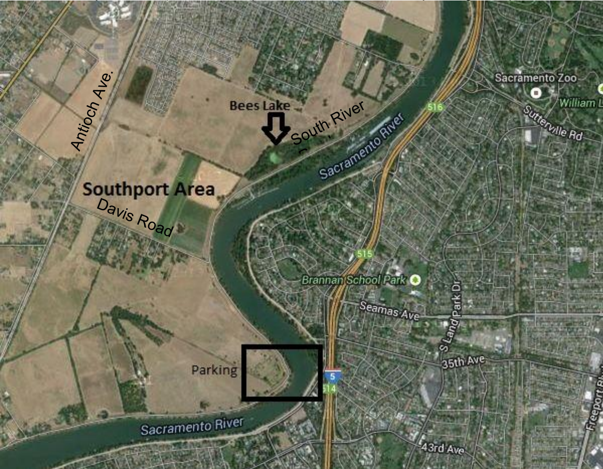
Site 2 - South Cross Levee