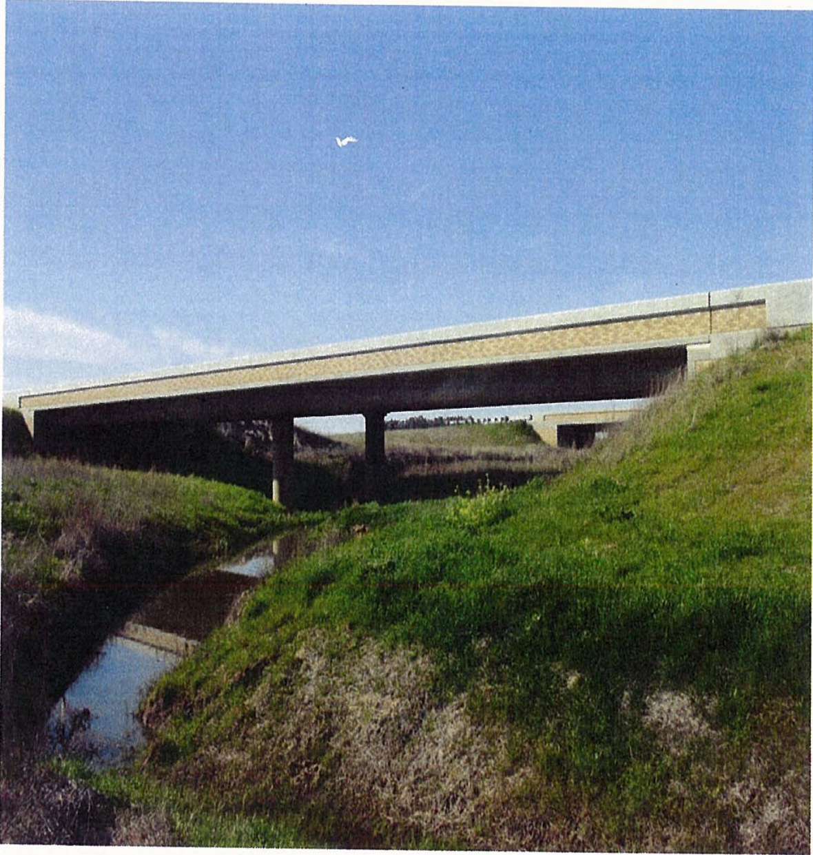
BIG YANKEE SLOUGH BRIDGE RIGHT - LOOKING WEST